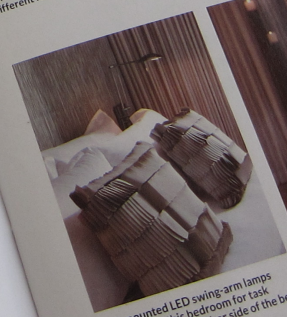
Wall mounted LED swing-arm lamps were used in this bedroom for task lighting to read on either side of the bed.

Lighting defines an interior. It can turn a room into a small stage or highlight a cozy corner. In this living room, the fireplace creates mood, the recessed overhead directional lighting accentuates the artwork and casts dramatic shadows on the Venetian plaster wall, while the flicker from candlelight creates a warm intimacy. Floor lamps for task lighting were placed at either end of the sofa for reading and illumination at eye level. By using four different light sources this room can be changed to accommodate a variety of different functions by day or night.