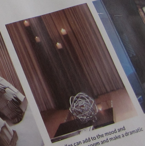
Candles can add to the mood and ambience in a room and make a dramatic statement.